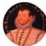
Sir Francis Drake BORN: c. 1543 DIED: 29 JANUARY 1596