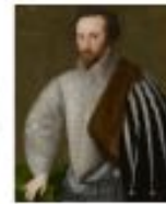
Sir Walter Raleigh BORN: c. 1552 DIED: 1618