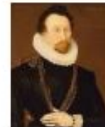
John Hawkins DIED: 1595