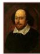
William Shakespeare BORN: 23 APRIL 1564 DIED: 23 APRIL 1616